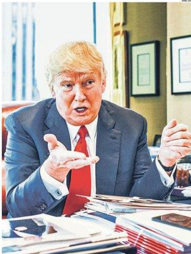
Donald Trump in his office at Trump Tower during his interview with The Times. He told Michael Gove: "I love the UK"

hoped that a deal could be done to reduce nuclear capability in return for dropping some sanctions on Moscow. "They have sanctions on Russia — let's see if we can make some good deals with Russia. For one thing, I think nuclear weapons should be way down and reduced very substantially, that's part of it."