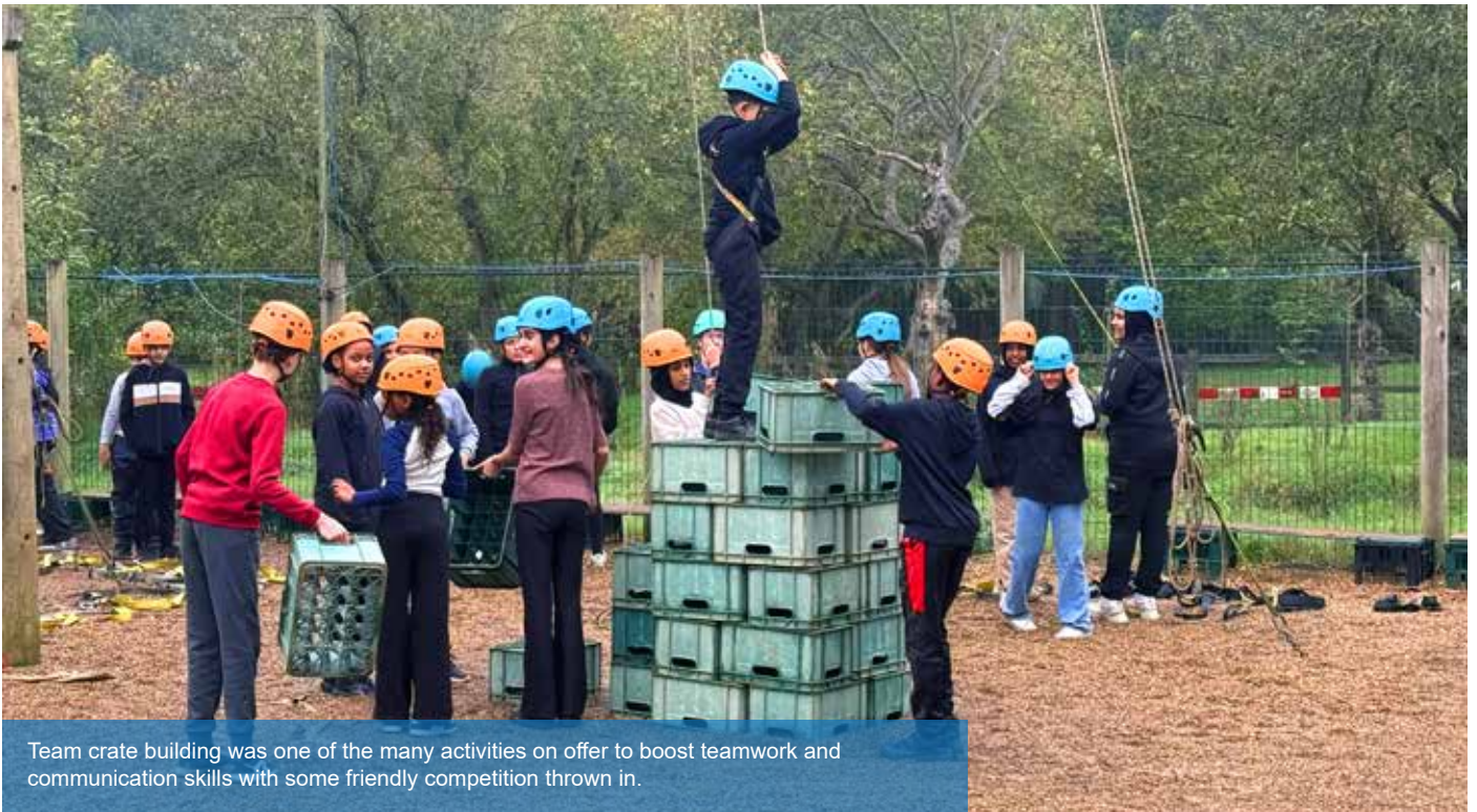
Team crate building was one of the many activities on offer to boost teamwork and communication skills with some friendly competition thrown in.

On Friday 18 th October 2024, our new Year 7 students set off for an exciting day of adventure at Longridge Activity Centre. The trip was designed to help students settle into their new year group, make new friends, and strengthen their teamwork skills through a variety of fun and challenging activities.