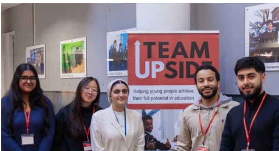
Team UPside was set up by young professionals to help other young people reach their academic and professional potential.

Team UPside, a charity specialising in helping young people to attain their full academic and professional goals, visited the Academy to run a careers and learning Breakfast Club to support Sixth Form students.