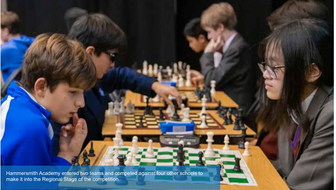
Hammersmith Academy entered two teams and competed against four other schools to make it into the Regional Stage of the competition.