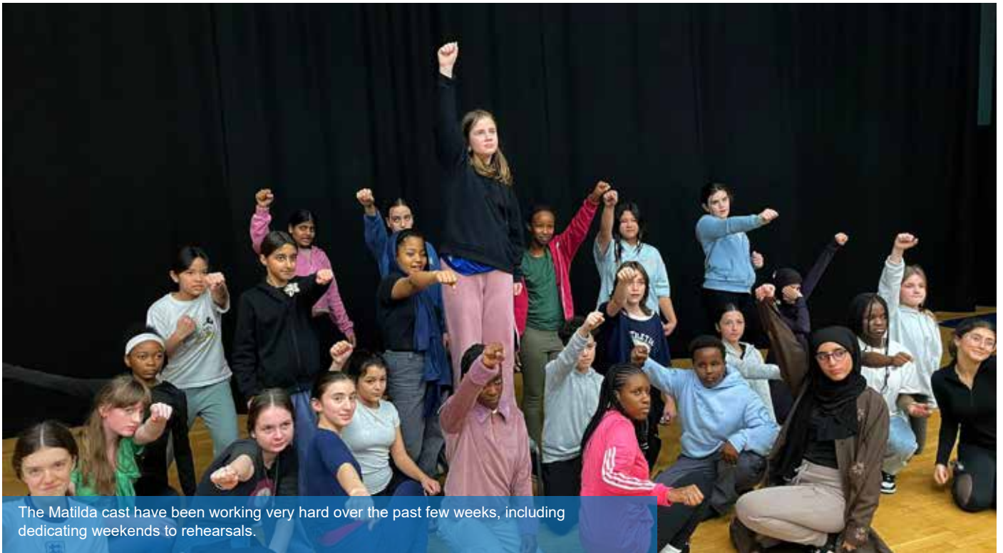
The Matilda cast have been working very hard over the past few weeks, including dedicating weekends to rehearsals.

The Drama and Music Departments are thrilled to announce that this year's Academy musical will be Roald Dahl's Matilda The Musical JR., set to enchant audiences in February 2025.