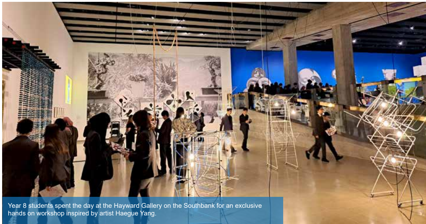
Year 8 students spent the day at the Hayward Gallery on the Southbank for an exclusive hands on workshop inspired by artist Haegue Yang.

THE ART DEPARTMENT TAKES US THROUGH ALL THE CREATIVE EXPERIENCES THAT HAVE TAKEN PLACE THIS TERM ACROSS THE ACADEMY.