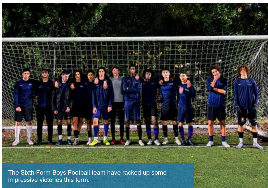
The Sixth Form Boys Football team have racked up some impressive victories this term.