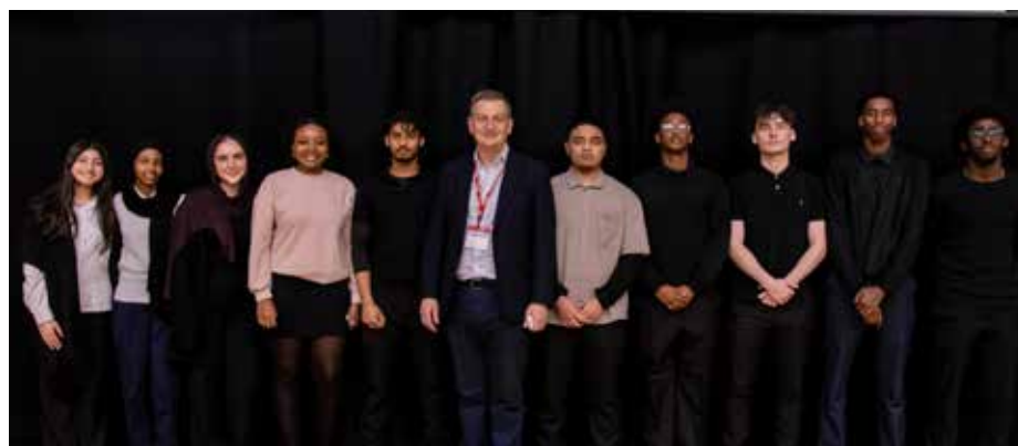
Diverse Futures help connect exceptionally talented young people with companies and businesses and develop their soft skills and expertise.

CEIAG – or Careers Education, Information, Advice and Guidance – is often about asking the right questions and listening carefully to the answers. We've been encouraging our students to make the most of opportunities on offer.