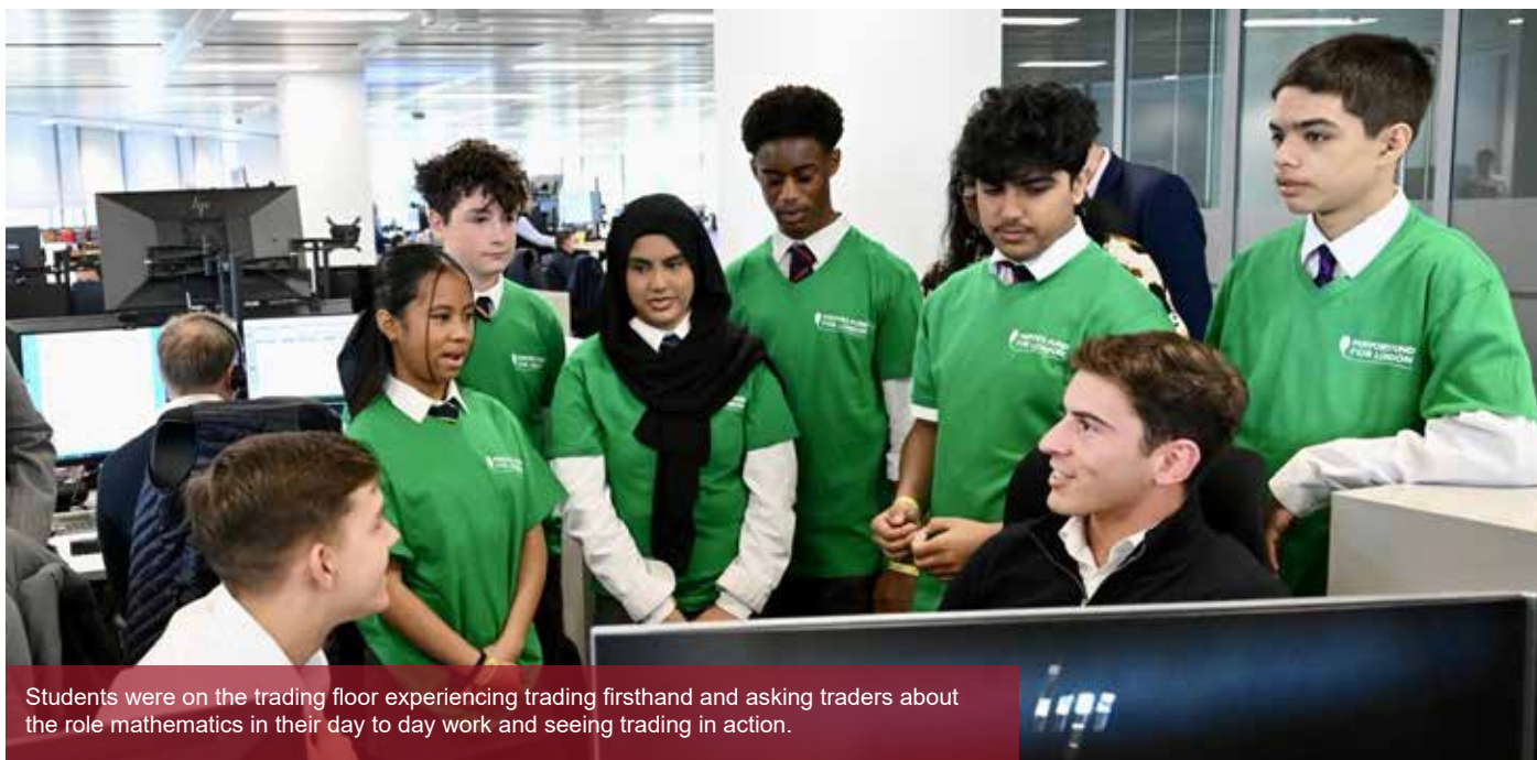
Students were on the trading floor experiencing trading firsthand and asking traders about the role mathematics in their day to day work and seeing trading in action.

The Mayors' Fund for London run Numbers@Work- an employability and skills programme for students to see how maths is used in workplaces. This September, we were invited to meet the Mayor of London, Sadiq Khan during a BGC fundraiser event. BGC is a global financial services company who hold an annual fundraiser with traders donating the day's commission to charities including the Mayor's Fund for London.