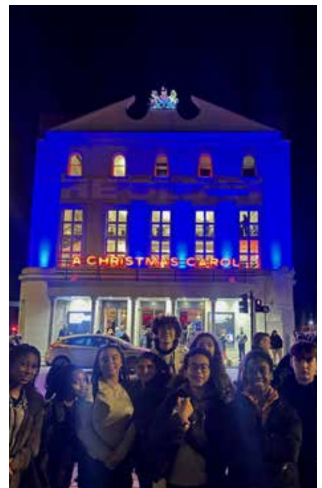
Students outside The Old Vic Theatre before the A Christmas Carol performance.

These workshops have sparked interest in different theatre careers, from lighting and sound to set design and playwriting. One student said, "I never knew how much work goes into a play. Now I'm thinking about being a costume designer or trying directing!" The Old Vic partnership has inspired students, leaving them eager for the next show and full of fresh ideas for the future. ■