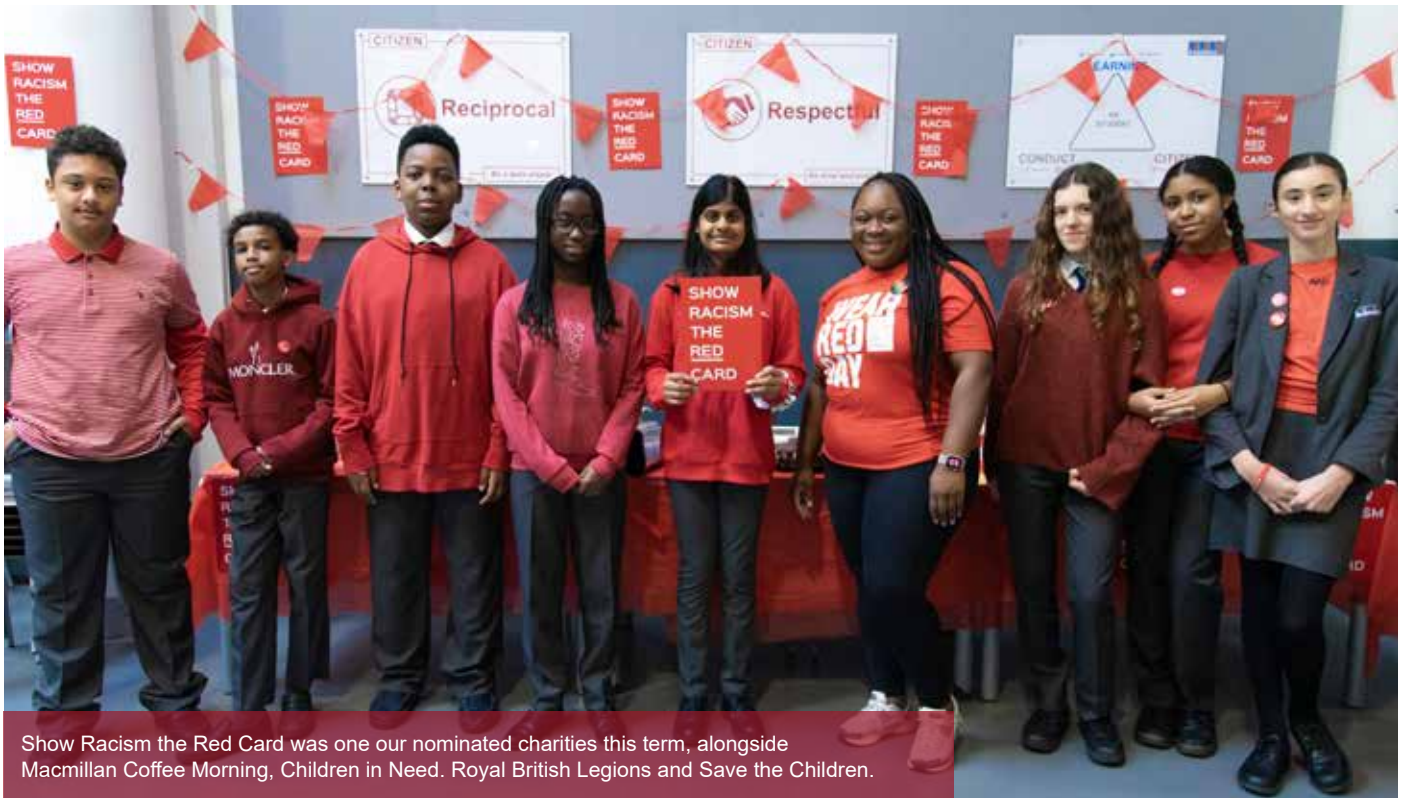
Show Racism the Red Card was one of our nominated charities this term, alongside Macmillan Coffee Morning, Children in Need, Royal British Legions and Save the Children.