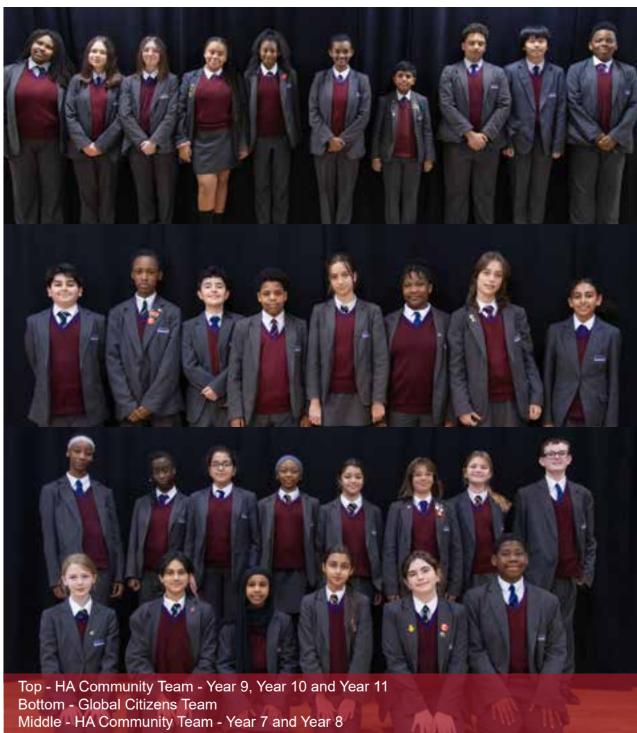
Top - HA Community Team - Year 9, Year 10 and Year 11 Bottom - Global Citizens Team Middle - HA Community Team - Year 7 and Year 8

Building on this momentum, students are now focusing on supporting our local food bank to help those in need in our community. To encourage