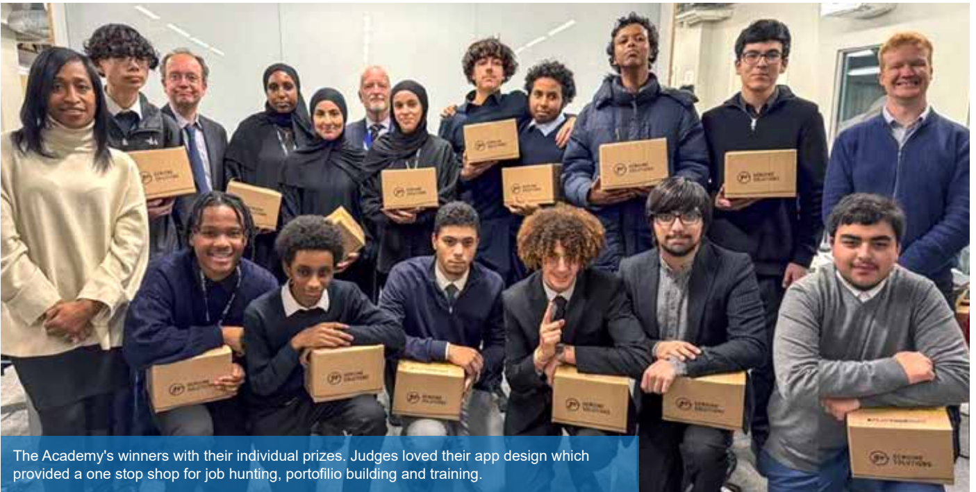
The Academy's winners with their individual prizes. Judges loved their app design which provided a one stop shop for job hunting, portfolio building and training.

On Thursday, 14 th November, the annual Hackathon, sponsored by the Worshipful Company of Information Technologists (WCIT), returned for its third instalment. This year's event, held in the historic Ada Lovelace Room at City, University of London, tasked students with using technology to make Further and Tertiary education more effective and accessible.